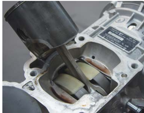
The pistons suffered only minor scuffing.