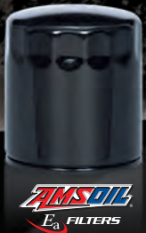
AMSOIL E3 FILTERS