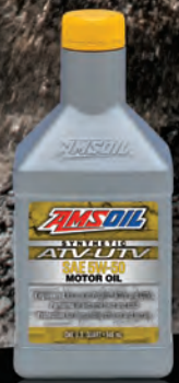
SYNTHETIC MOTOR OIL