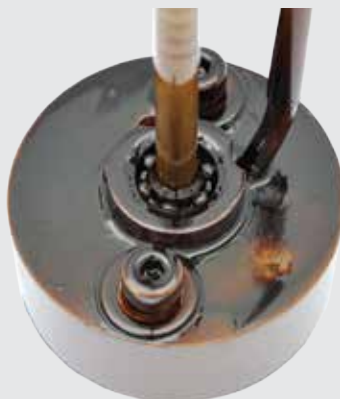
LEADING CONVENTIONAL HYDRAULIC FLUID (ISO 46)