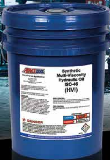
SYNTHETIC HYDRAULIC OIL