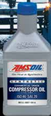
SYNTHETIC COMPRESSOR OIL